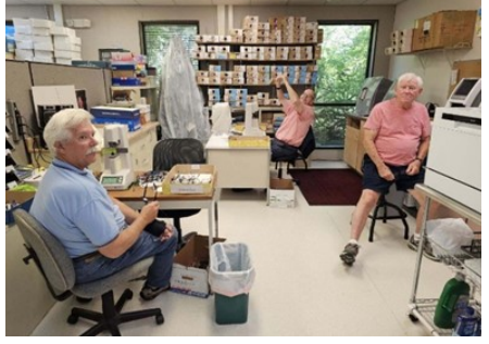
prescription reading and lens grinding